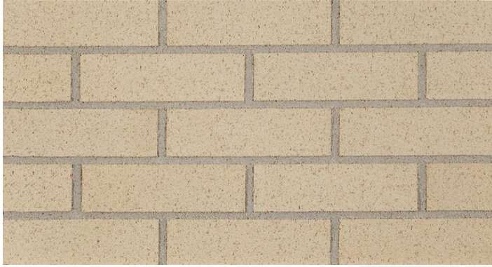
Cream Style Brick

For other materials more variety in color is acceptable, with a preference for natural, neutral colors. Neon and excessively bright colors are not considered acceptable. The use of multiple colors is preferred. Some examples of preferred colors are shown below; however, this is not an exhaustive list of acceptable colors.