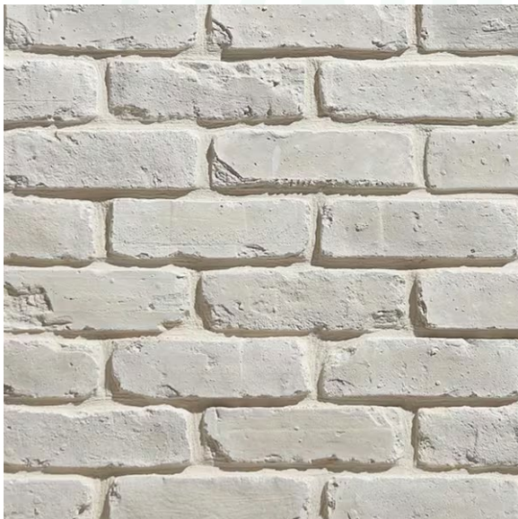
White Style Brick