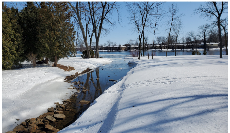
February Calendar Photo

We urge community members to learn the sources and signs of CO buildup. Reach out to the Kaukauna Fire Department for help installing or obtaining your CO alarm. Working smoke and CO detectors save lives by warning residents about accumulating carbon monoxide.