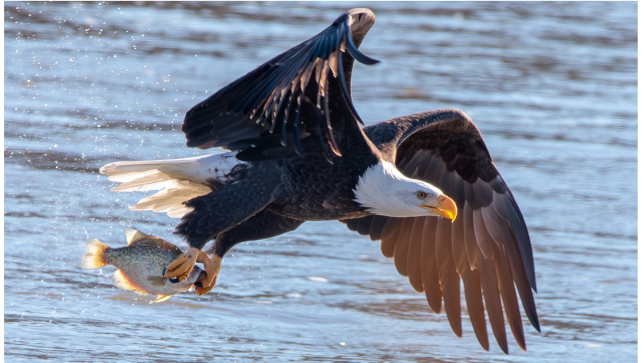
January Calendar

Click here for winter programs from the Kaukauna Public Library, Grignon Mansion, and 1000 Islands Environmental Center. For other winter events in the City of Kaukauna, check out the Community Calendar, available on our website here .