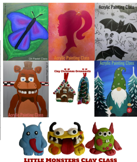
LITTLE MONSTERS CLAY CLASS

* Classes are usually scheduled for two (2) hours, however there can be some variation of the length of the class due to an individual's painting speed.