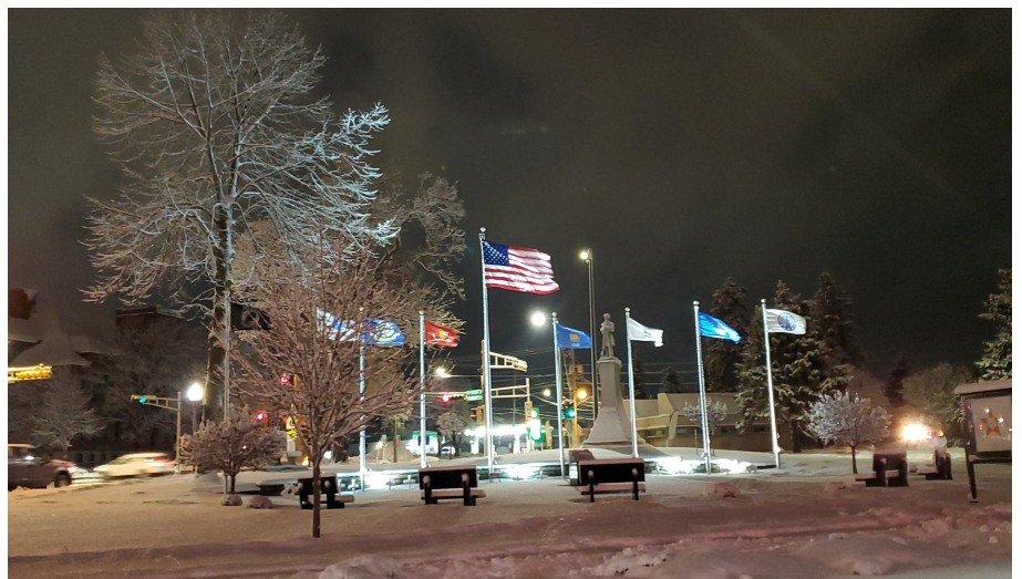
December Calendar