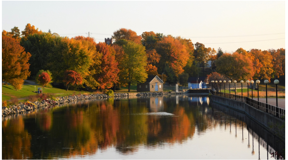
October Calendar Photo Submitted by Allison Mischler

Do you have string lights that you no longer need or have stopped working? Please do not throw them in your garbage or curbside recycle bin. 1000 Islands Environmental Center accepts all string lights and will recycle them for you free of charge. Drop them in the bin by the main entrance door any time that is convenient for you. 1000 Islands Environmental Center is located at 1000 Beaulieu Ct., Kaukauna, WI. Please call 920.766.4733 with questions. Thank you for recycling!