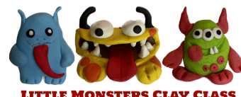
LITTLE MONSTERS CLAY CLASS