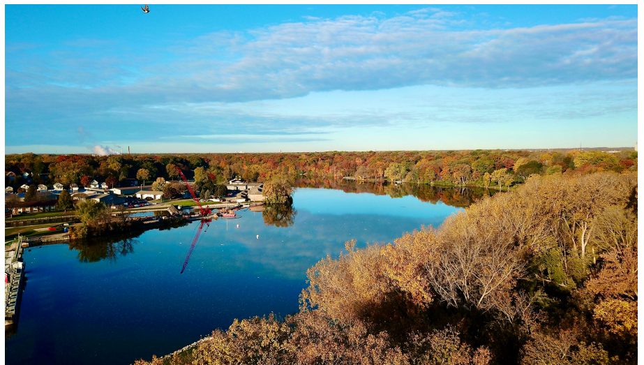
September Calendar