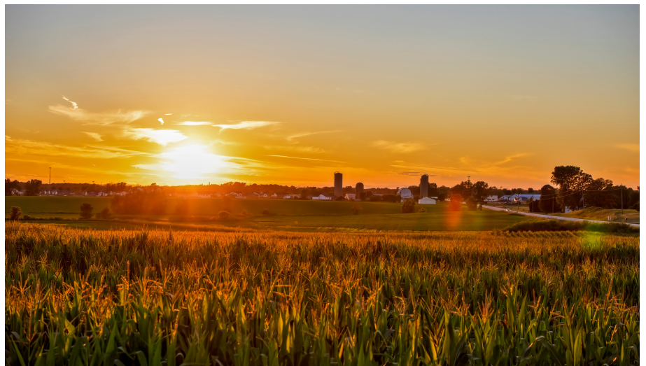
August Calendar