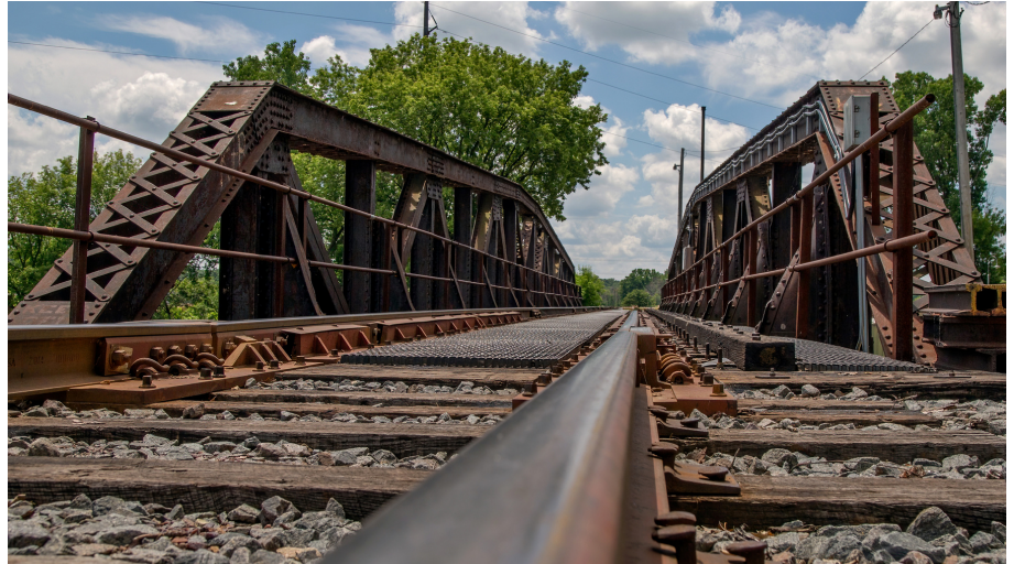
July Calendar