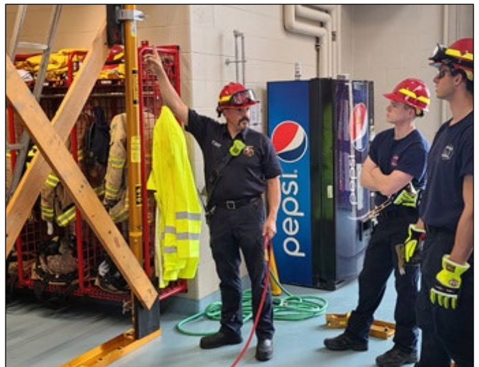
A building collapse creates a very dangerous work environment. Firefighters review techniques on how to stabilize structures to create a safe work environment.