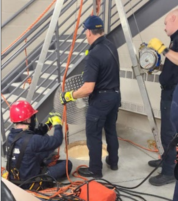
Firefighters training on safely entering a confined space to ensure responder safety