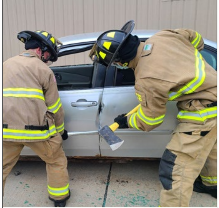
New recruits working on basic skills of automobile extrication