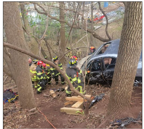
Vehicle extrication training with several of our neighboring departments.