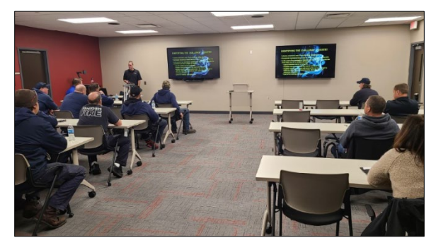
Firefighters from Kaukauna, Oshkosh, Appleton, and Fond Du Lac attend ammonia training in our training room.

Also new this year was training with the lock system. With the locks operational again, our firefighters conducted training on how to operate the system in case of emergency. This was one of several training sessions that were filmed and developed for use on our video-based training system. This software system allows courses to be developed,