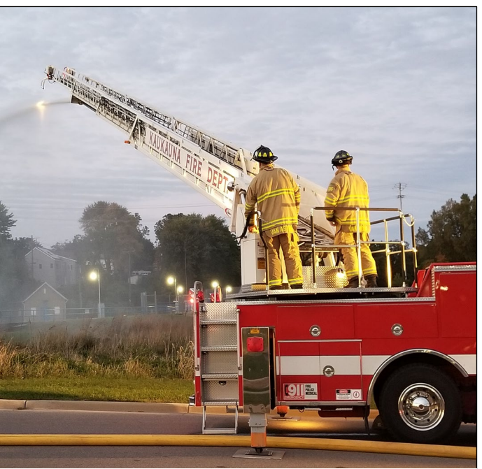
Our paid-on-call staff training with our ladder truck.