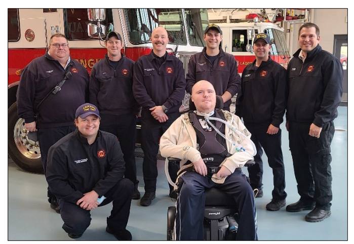
Firefighters had the chance to meet with a cardiac arrest survivor that was resuscitated by our crew.

Service again received funding from the State of Wisconsin Funding Assistance Program. This program provides funding to assist EMS organizations in equipment purchases and continued training. A formula-based algorithm is used to distribute monies to transporting EMS agencies throughout the state of Wisconsin. Kaukauna received $4,786.90 for FY2021.