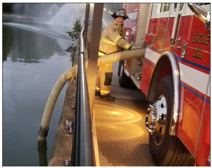
If there is a need, water from the river and canals can be utilized to fight fire.