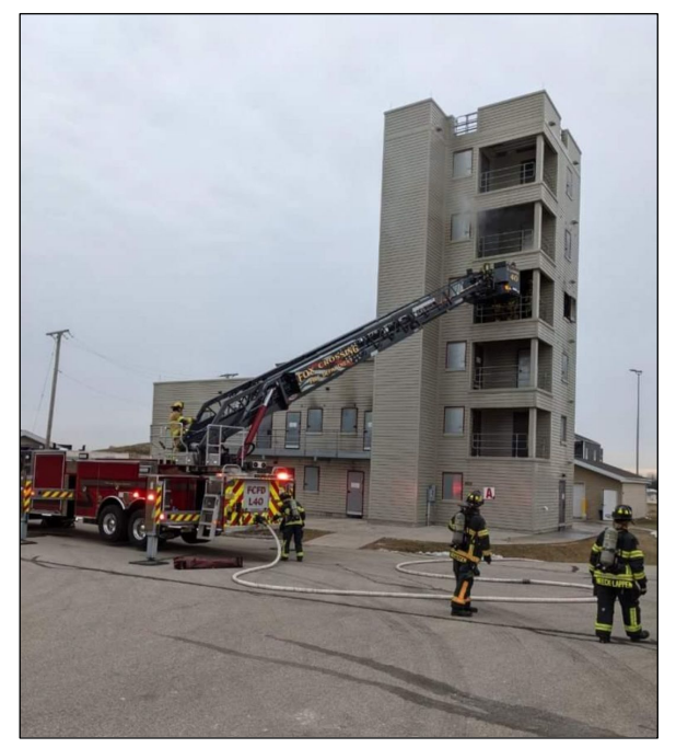
Firefighters from several Fox Valley fire departments participate in joint high-rise training.