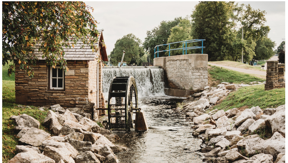
May Calendar

Please call the Street Department at 920.766.6337 with any questions.