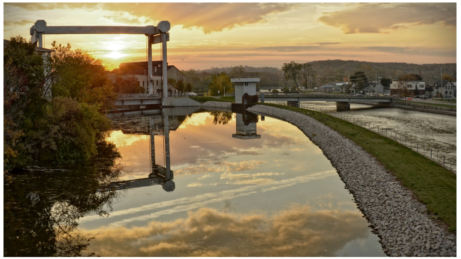
April Calendar Photo Submitted by Ron Powell

Leaves, garden debris, small sticks, and twigs MUST be in a Yard Master or equal 2-ply Kraft paper compost bag that are designed for yard waste disposal. These bags can be purchased at local hardware and grocery stores. Additionally, residents can use open containers with handles, no larger than thirty (30) gallons, and not weighing more than fifty (50) pounds. Plastic bags, grocery bags, and cardboard boxes containing yard waste will not be collected.