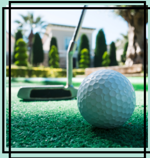
18-Hole Mini Golf