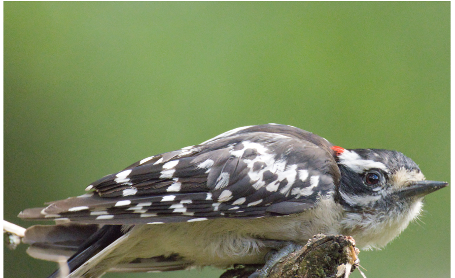
July Calendar

All major appliances must have a sticker before being placed out for collection. Stickers can be purchased at the Street, Park and Recreation office at 207 Reaume Avenue, Monday through Friday, between the hours of 8:00am and 4:30pm. Refrigerant stickers (refrigerator, freezer, air conditioner, and dehumidifier) are $15. Non-refrigerant stickers (washer, dryer, stove, oven, dishwasher, microwave, furnace, and water heater) are $10. Please call the Street Department at 920.766.6337 with any questions.