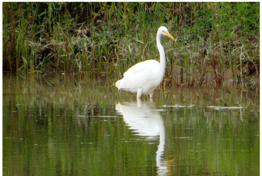
April Calendar Photo Submitted by Carmen Poppleton

Please stay tuned to our website and social media for updates.