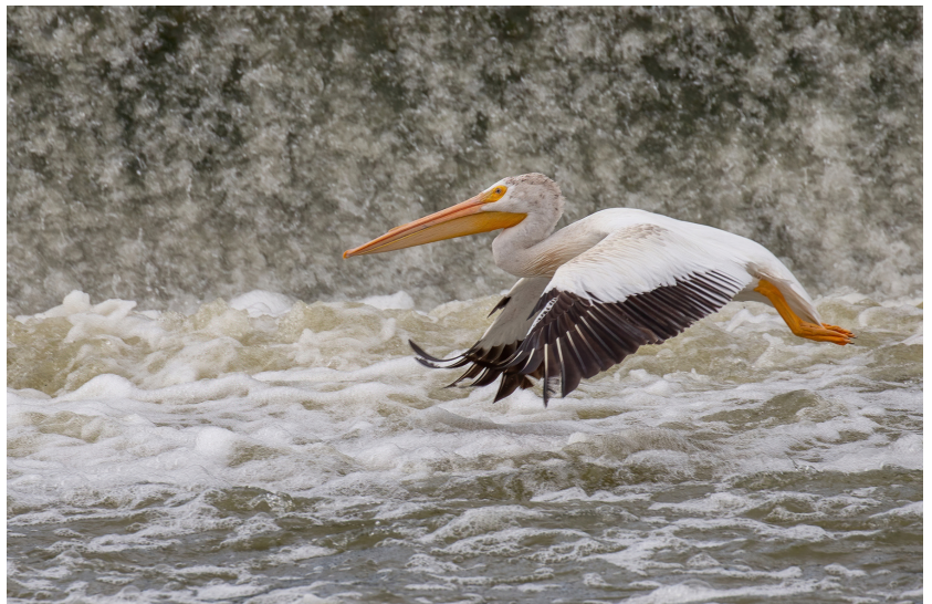
May Calendar Photo Submitted by Heather Landers