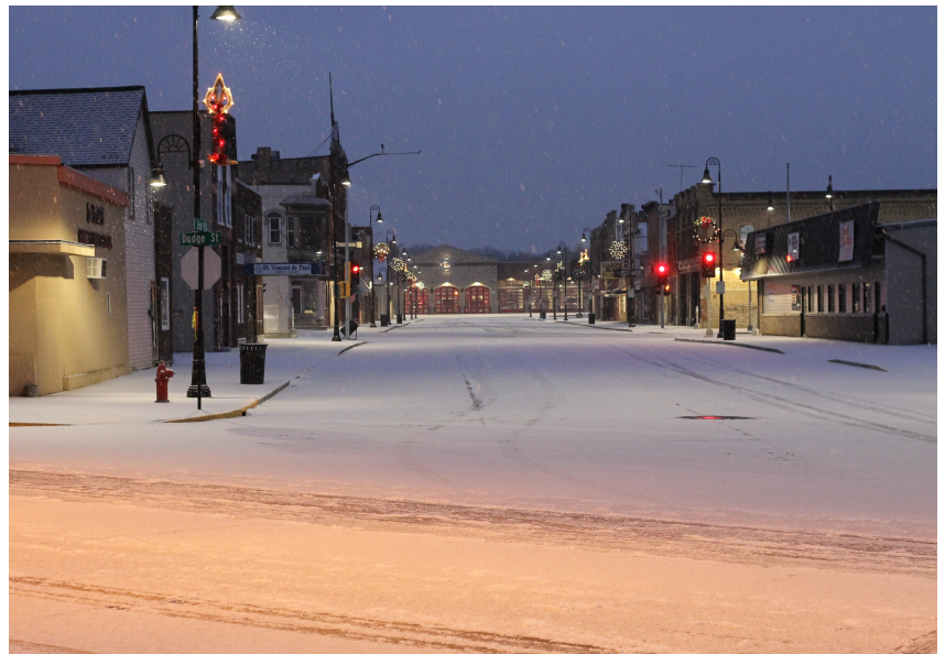
December Calendar

Please note that because Halloween falls on a weekend (Sunday) this year, Trick-or-Treat hours for the City of Kaukauna will be 1:00 PM-4:00 PM on October 31, 2021.