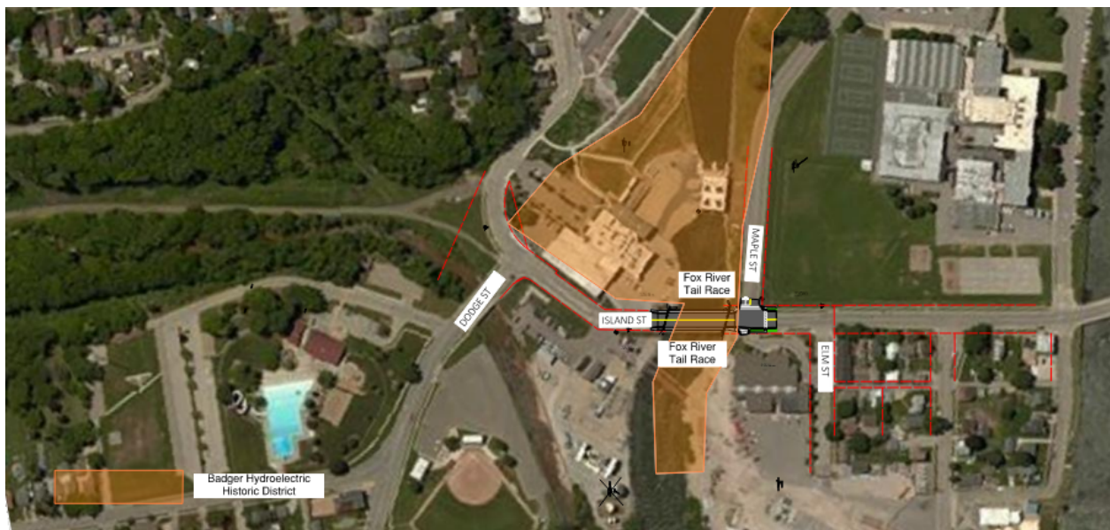
Figure 3: Section 4(f) Resources

The Riverview Middle School and Badger Hydroelectric Historic District are within the project limits and are considered Section 4(f) properties. Section 4(f) resources are publically protected parks, recreation areas, wildlife, or waterfowl areas and any significant historic or archaeological sites. In the case of this project, we have determined that we are not impacting the Riverview Middle School property and the proposed bridge project is not adversely impacting the characteristics of the historic district.