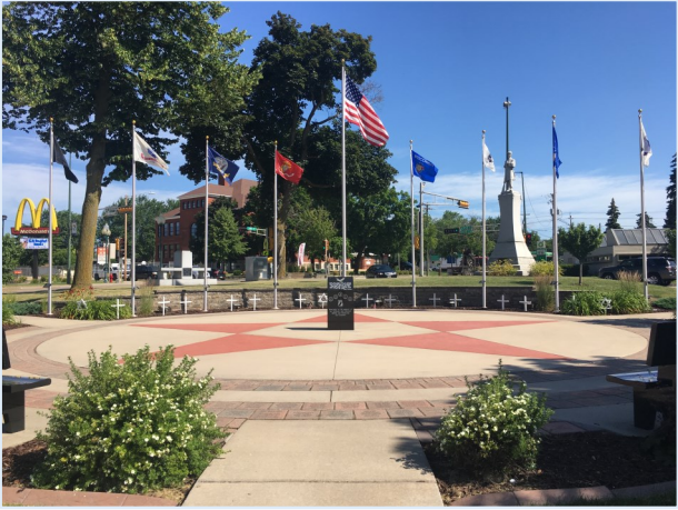
Urban Open Space