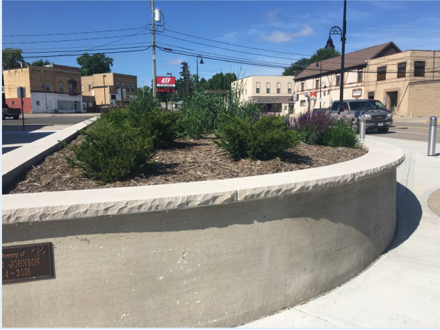
Urban Open Space